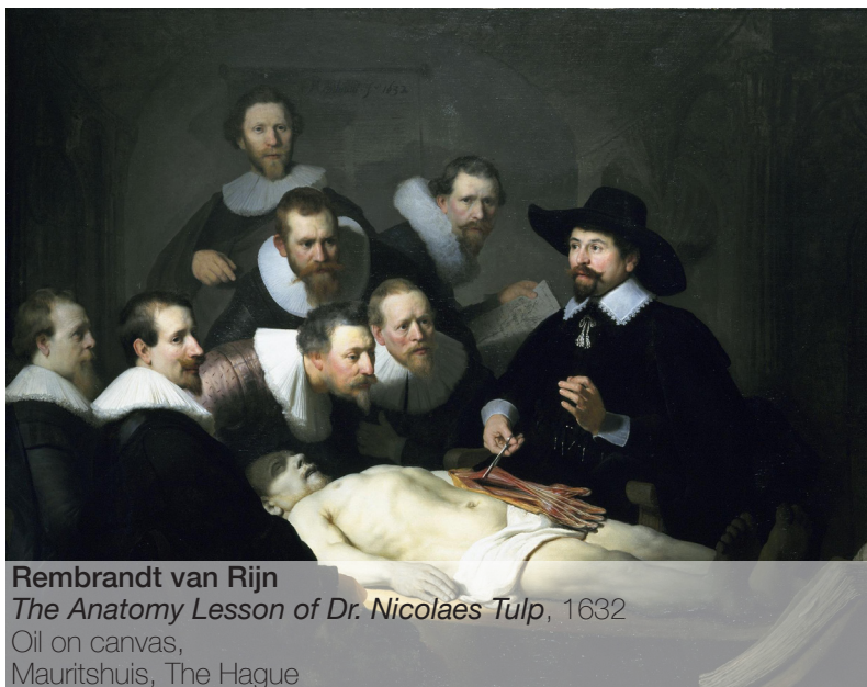
Rembrandt van Rijn The Anatomy Lesson of Dr. Nicolaes Tulp , 1632 Oil on canvas, Mauritshuis, The Hague

Julius Caesar! I find ancient Rome so interesting. And honestly I would probably put a 20 piece chicken nugget and large diet coke from McDonalds on the menu. Total guilty pleasure right there!